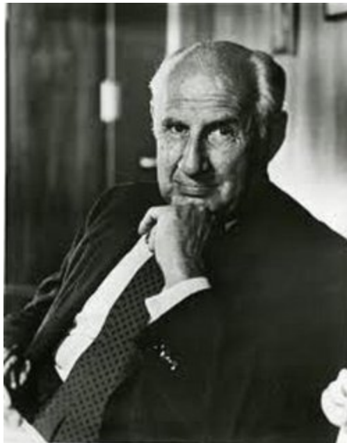
Added by The Silent Forgotten